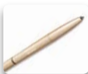
Ceruzka na obočie