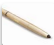
Kontúrovacia ceruzka na oči