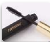
Vodovzdorná maskara 200