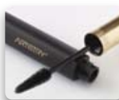
Nerозmazateľná maskara 200